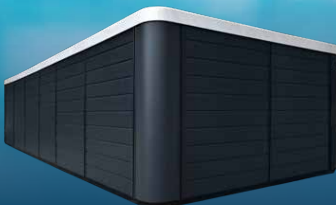
Slate Grey Cabinet